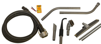
Ø1.5 (Ø38 mm) Static Dissipative Tools and Accessories - Included