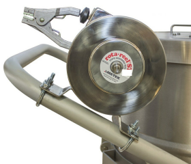
Grounding reel with stainless steel housing and cable - Optional