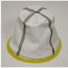
Main Cloth Filter, Static Dissipative - Included