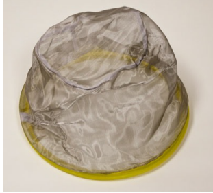
Liquid Filter - Optional