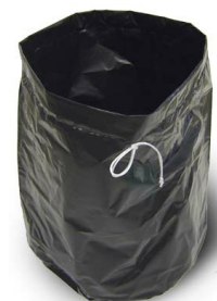
Conductive Polyliner Recovery Bag - Optional