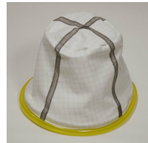
Main Cloth Filter, Static Dissipative - Included