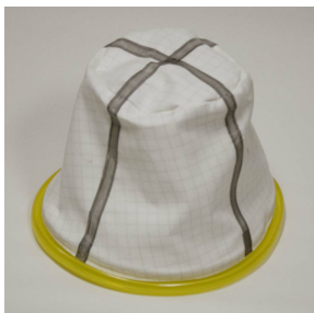
Main Cloth Filter, Static Dissipative - Included