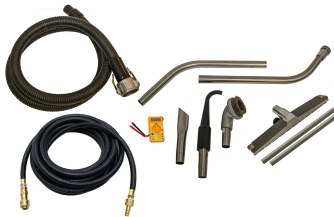
Ø1.5" (Ø38 mm) Static Dissipative Tools and Accessories (Pneumatic) - Included