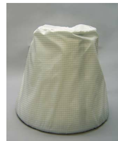
Pre-Filter, Static Dissipative - Included