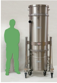
CD-10 EX (APS) next to an average sized man