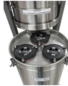
CD-10 EX (APS) Filtration top view