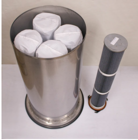
CD-10 EX (APS) Filtration bottom view