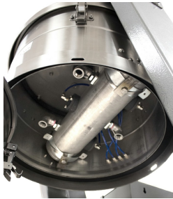
Fully integrated diaphragm valves for Automatic Reverse Purge (APS) System. All Stainless Steel