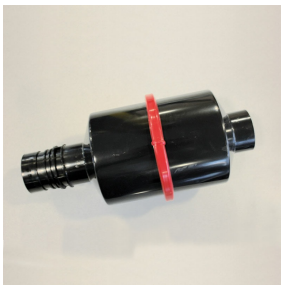
Detachable Exhaust Silencer (GL Series)