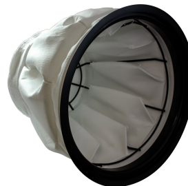
Star Shaped Polyester Main Filter