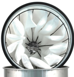
Star Shaped Polyester Main Filter