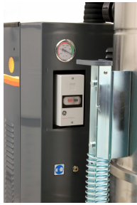
Planet Filter Blockage Indicator Gage. Manual Starter with Overload Protection