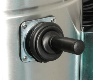
Side Mounted Manual Filter Shaker