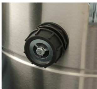
Planet Vacuum Relief Valve (VRV)