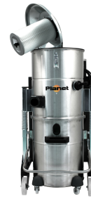
PLANET 740S & 740S MB Polyester Filter Cartridge - Included