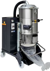
Planet Longopac® "Endless" Collection System