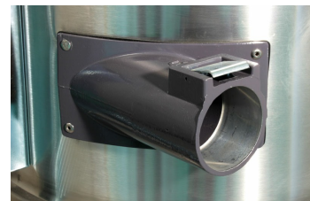
Tangential Suction Inlet, 70 mm, Aluminum