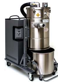
CD-35L (DT) EX (MRP) EXTENDED with Recovery Tank removed