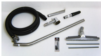
Ø2" (Ø50 mm) Static Dissipative Tools and Accessories - Included