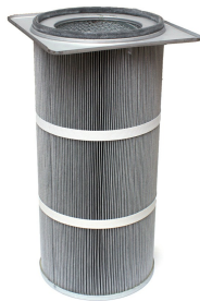
Purge Filter Cartridge - Included