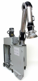
CD-600 view of Purge Filter Cartridge