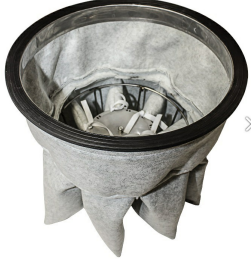
Conductive Star Shaped Filter with Cage - Included