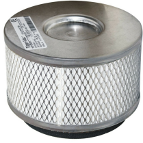
HEPA Filter - Included