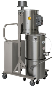
CD/EUR-36L EX DT (MFS) HEPA with Recovery Tank and Filter Chamber removed