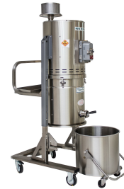
CD/EUR-36L EX DT (MFS) ULPA with Recovery Tank removed