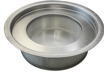
Internal (upstream) HEPA filter No. 219212 - Optional