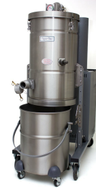
CD-100L (DT) EX (MFS) with Recovery Tank removed