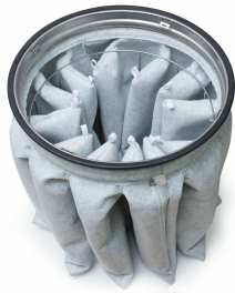
Conductive Star Shaped Filter with Cage - Included