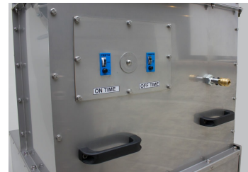
CD-600 EX SS Control panel