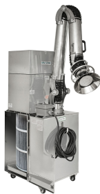
CD-600 SS Housing side door with access to Cartridge