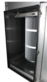
CD-600/TV-600 SS Purge Filter Cartridge in housing