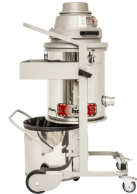
C-35L EX DT (MFS) with Recovery Tank removed