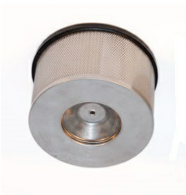
Upstream HEPA Filter - Included