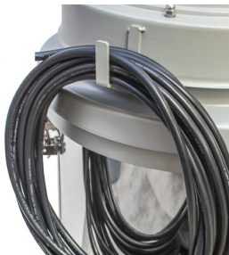
Cable Holder Hook included on the side of the powerhead