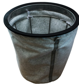
Main Cloth Filter and Cage, Static Dissipative - Included