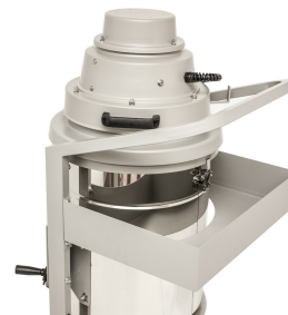
C-35L EX DT (MFS) Tool Basket