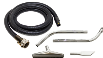
C-35 EX DT Tool Kit - included