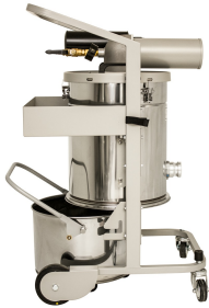
AVSD-25L Detachable Tank