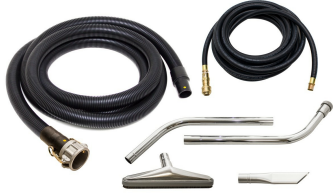
AVSD-25/35/55L Tool Kit - Included