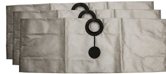
Conductive Recovery Bags - included