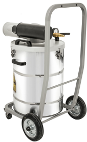
AVSD-40L (2+2W) Rear View