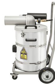
AVSD-40L (2+2W) Side View