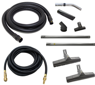
ATEX/AVSD Tools and Accessories W&D - Included