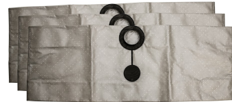
Conductive Recovery Bags - included