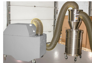
HEC-200 (4W) STAINLESS STEEL w/8" Inlet and Outlet in conjunction with CD-1200 EX Portable Dust Collector