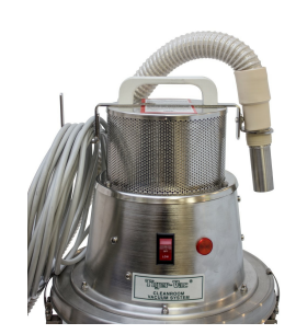
Stainless steel holding bracket - Optional