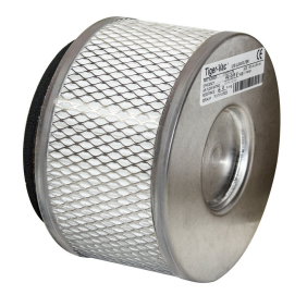
ULPA Filter - Included