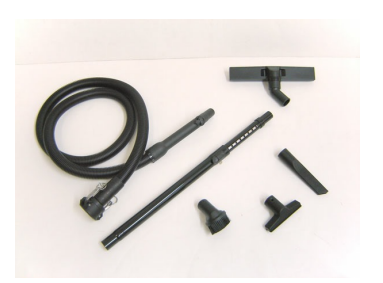
# 323600 - Ø1.25" (Ø32 mm) Standard Tools and Accessories (Kit #1) - Optional