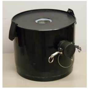
Safe containment canister - Included