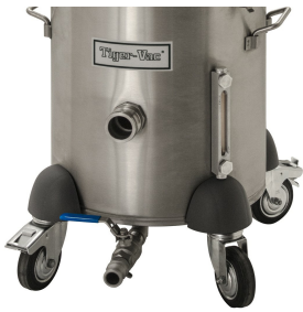
Liquid Level Indicator and Drain Valve - Included