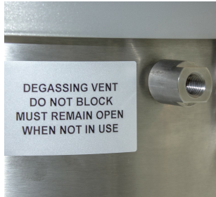
Degassing Vent - Included