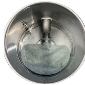
A Conductive "Wet" Recovery Bag can be used in conjunction with the Immersion Bath to facilitate material recovery and emptying