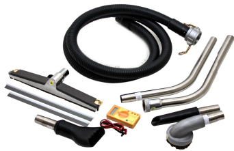
Tool Kit for Mini Series - Included