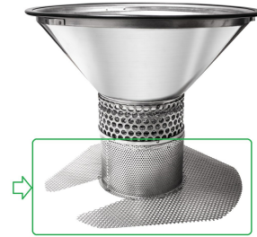
#228093 - Depressor cage for conductive wet recovery bag - optional