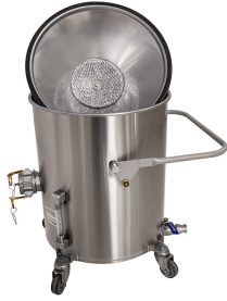
Cone assembly and detachable recovery tank with liquid level indicator and drain valve - Included