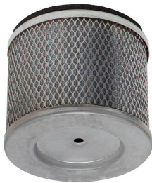
Coalescing HEPA filter (Upstream) - Included