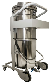
Mini Enhanced - Rear View