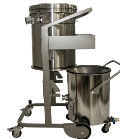
Mini Enhanced - Side View with detachable tank