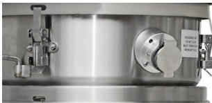
Degassing Vent - Included