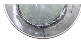
Conductive "wet" recovery bag - Included