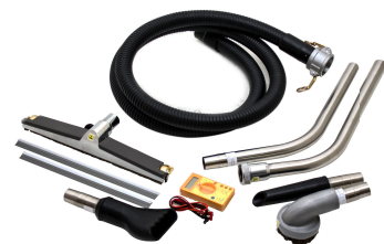
Tool Kit for Mini Series - Included