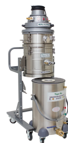
C-10EX (IT-63L) CFE SK HEPA with Recovery Tank removed