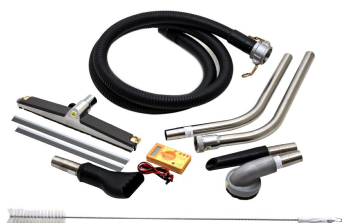
C-10 EX (IT-63L) Tool Kit