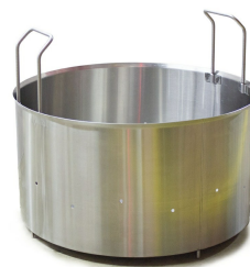
Sieve Basket - Included