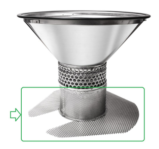
#228093 - Depressor cage for conductive wet recovery bag optional