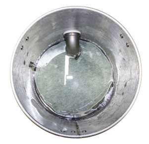
Conductive "wet" recovery bag - Included