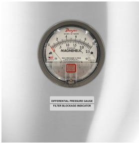
Optional Differential Pressure Gauge for SS Models (Filter Blockage Indicator) available