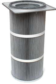
Purge Filter Cartridge - Included