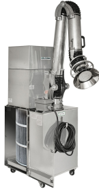
CD-600 SS Housing side door with access to Cartridge