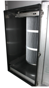
CD-600/TV-600 SS Purge Filter Cartridge in housing