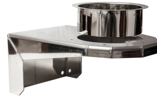
Wall Mount Bracket for Dust Extraction Arm - Optional