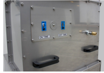
CD-600 EX SS Control panel