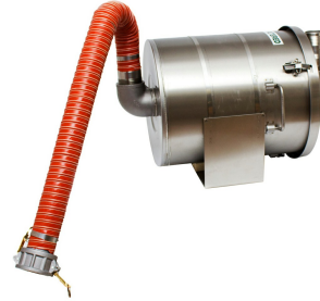
HEPA Filter - Upstream - Optional