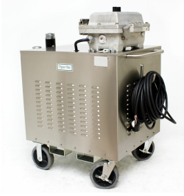
CDPU-10 EX Rear View