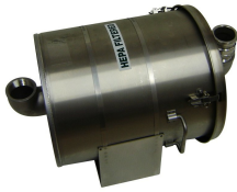
HEPA Filter - Downstream - Optional