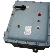
European Switch Box - Optional