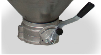
Gate Valve 8" - Included