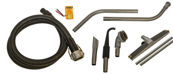
Ø1.5 (Ø38 mm) Static Dissipative Tools and Accessories - Included