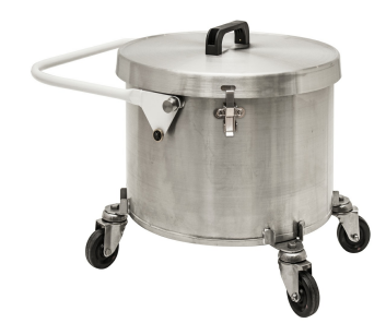
Extra recovery tank with lid to facilitate the refresh and re-use of the recovered powders (Part# 223001-ASM1) - Optional

3D Tool Kit for 2" camlock suction inlet - included