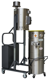
CD/EUR-36L EX DT (MRP) ULPA with Recovery Tank and Filter Chamber removed