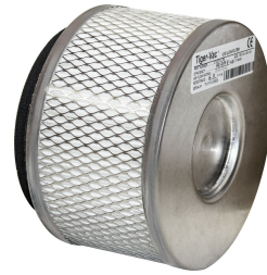
ULPA Filter - Included