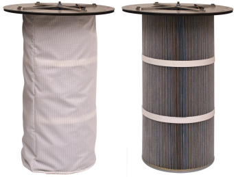
Conductive Aluminized Spun Bond Reverse Purge Cartridge (shown with and without optional skirt) - Included