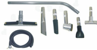
Ø2" (Ø50 mm) Static Dissipative Tools and Accessories - Optional