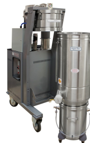
CD-10/7 EX (APS-EXTENDED) with Middle Ring and Recovery Tank removed