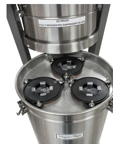
CD-10 EX (APS) Filtration top view