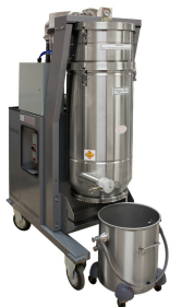
CD-10/7 EX (APS-EXTENDED) with Recovery Tank removed