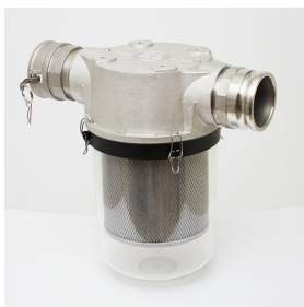
See-Through Polyester Safety Filter Element - Included