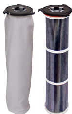
CD-10/7 EX (APS) Conductive Aluminized Spun Bond Reverse Purge Cartridge (shown with and without optional skirt) - Included