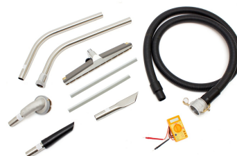
Ø1.5" (Ø38 mm) Static Dissipative Tools and Accessories - Optional