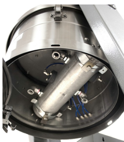
Fully integrated diaphragm valves for Automatic Reverse Purge (APS) System. All Stainless Steel