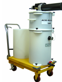
CS-ARU-15 STD (HY-C)