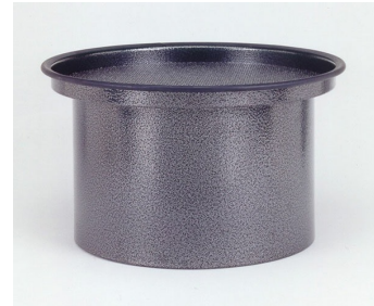
Activated Carbon Cartridge - Optional