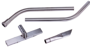
LARU Tools and Accessories - Included