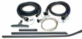
ARU EX Tools and Accessories - Included