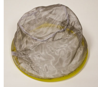
Liquid Filter - Included