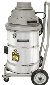
C-10 EX (2+2W) SIDE VIEW