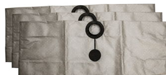
Conductive Recovery Bags - included