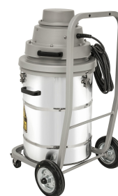
C-10 EX (2+2W) REAR VIEW