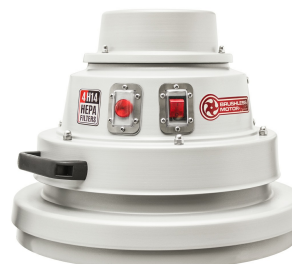
Longer Life Brushless Motor Available (always with 4 x H14 HEPA filters)