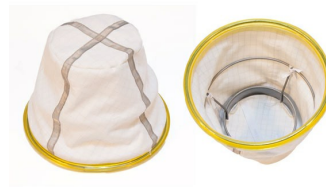
Main Cloth Filter with Cage, Static Dissipative - Included