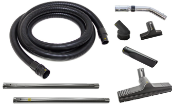
C-10EX Static Dissipative Tools and Accessories - Included