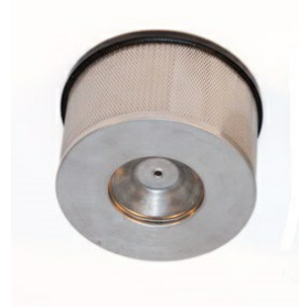
Upstream HEPA Filter - Included