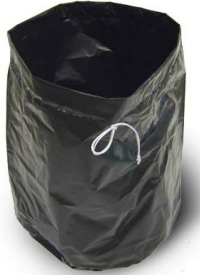
Conductive Polyliner Recovery Bag - Included