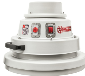
Longer Life Brushless Motor Available (always with 4 x H14 HEPA filters)