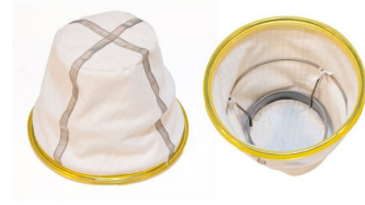
Main Cloth Filter with Cage, Static Dissipative - Included