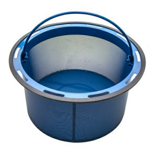
Strainer Basket for the separation and collection of metal chips and metal shavings - Included