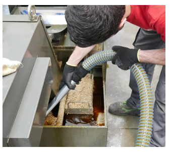
HOGOIL Typical application