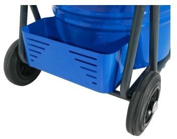
HOGOIL PUMP and STANDARD Tool Basket