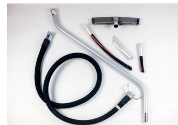
Tools and Accessories (Nitrile) - Included