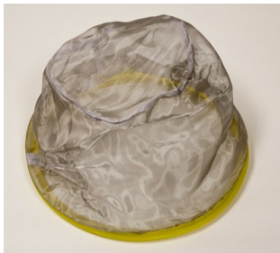
Liquid Filter - Included