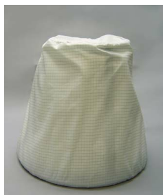
Pre-Filter, Static Dissipative - Included