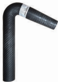
NECK 65° Bend