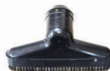
WALL BRUSH 9 in. (23 cm)

3 EXTENSION POLES 5 ft. (1.5 m) EACH POLE